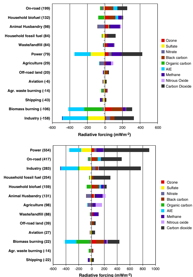
Fig. 1. Radiative forcing due to perpetual constant year 2000 emissions grouped by sector at (a) 2020 (b) 2100 showing the contribution from each species. The net sum of total radiative forcing is indicated by the title of each bar. A positive RF means that removal will result in climate cooling and vice versa.

Synthesis: Climate Impacts of Current Emission Sectors. We present the future RF from year 2000 emissions at time points 2020 (Fig. 1A) and 2100 (Fig. 1B) grouped by sector. The largest net near-term negative RFs are from the biomass burning and industry sectors due to substantial cooling effects from scattering aerosols and their impacts on clouds. Similarly, the power sector has a large cooling component through aerosols but the large CO 2 emission from this sector results in a net positive RF. On-road transportation and household biofuel exert the largest net positive RF in the near-term. For on-road transportation, the sum of the SLS effects is about the same as the CO 2 effect. Animal husbandry and waste/landfill, sectors with the largest D-CH 4 RF but zero CO 2 effects, are amongst the largest net warming activities in the near-term. The aviation sector has the smallest RF across all the human activities (consistent with the smaller fuel use relative to other activities). Here we do not include the effects of aviation emissions on contrails and cirrus clouds. The IPCC estimates a RF of +10 mWm -2 for the contrail effects (2), although the impacts of aviation emissions on cloudiness are highly uncertain. Aviation RF effects will be discussed further in a separate paper. Shipping has a net cooling effect, again the CO 2 RF is dominated by the SLS RF. While this sector has insignificant AIE in the present model, other studies suggest much larger AIE (30).